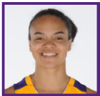
#20 KRISTI TOLIVER 5-7/130 MARYLAND 3rd WNBA Season