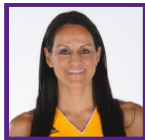
#21 TICHA PENICHEIRO 5-11/146 OLD DOMINION 14th WNBA Season