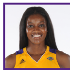
#8 DELISHA MILTON-JONES 6-1/185 FLORIDA 13th WNBA Season