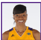
#32 TINA THOMPSON 6-2/178 USC 15th WNBA Season