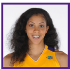
#3 CANDACE PARKER 6-4/175 TENNESSEE 4th WNBA Season