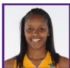
#45 NOELLE QUINN 6-0/175 UCLA 5th WNBA Season