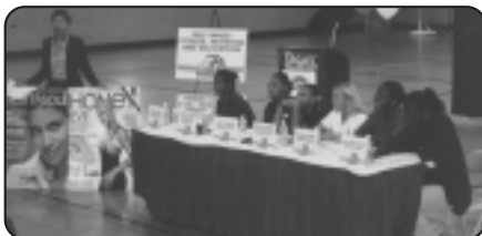
Shock panelists address the audience at the Police Athletic League

reaching goals, women in the workforce, self-image, careers, and time management. Shock players, joined by media personalities and community leaders serve as panelists and moderators.