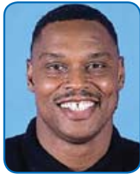
RICK MAHORN HEAD COACH

Rick Mahorn begins his fifth season as an assistant coach with the Shock, bringing over 20 years of professional basketball experience to the bench including a championship season with the Pistons in 1989 and WNBA title runs with the Shock in 2006 and 2008. Besides his extensive 18-year NBA playing experience, Mahorn served as head coach of the Rockford Lightning of the Continental Basketball Association (CBA) for the 1999-2000 season. He led the Lightning to a 15-7 overall record and the American Conference title, which earned them a No. 2 seed in the 2000 CBA Playoffs. Mahorn's coaching excellence was recognized in two CBA Coach-of-the-Month Awards. He then joined the coaching staff of the Atlanta Hawks under Lon Kruger during the 2000-01 season.