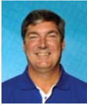
BILL LAIMBEER HEAD COACH